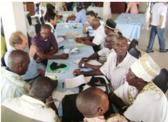
Businessmen of Linden and Brazil engaged in discussions on March 22, 2010, relating to investments in Linden

According to Hinds, Linden stands to benefit tremendously from the partnership and it would be the key economic driver in transforming the town from being known mainly for its bauxite mining activities.