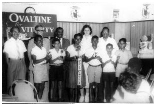
Winners at the Ovaltine Show—do you recognize them?