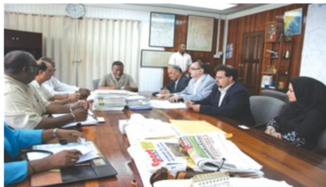
Iranian four member delegation (right) meets with Prime Minister Samuel Hinds at his Wight's Lane office.

Tuesday, 23 March 2010 (GINA) - A four-member delegation of Iranian geological survey experts from that country's Ministry of Industries and Mines met Prime Minister Samuel Hinds at his Wight's Lane, Kingston office yesterday.